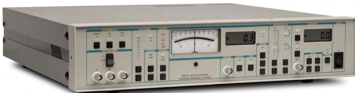
SR510 Lock-In Amplifier

An optional internal voltage-controlled oscillator provides both an adjustable-amplitude sine wave output and a synchronous, fixed-amplitude reference output. The sine wave amplitude can be set to 0.01, 0.1 or 1 V rms , and can drive up to 20 mA. The oscillator frequency is controlled by a rear-panel voltage input and can be adjusted between 1 Hz and 100 kHz. Typically, the sine wave output is used to excite some aspect of an experiment, while the reference output provides a frequency reference to the lock-in.