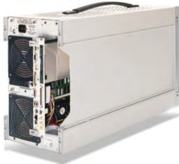
VXI-1200 FlexFrame - Back View

If you wish to control a FlexFrame System from a desktop computer using a MXI-2 interface, the VXI-MXI-2/B delivers the same performance as the standard C-Size interface but at a lower cost. Using the VXI-MXI-2/B in the back of the FlexFrame, you can use all size C-size VXI slots located in the front of the chassis for instruments. The smaller size and the absence of EMI shielding reduce the cost of the B-size VXI-MXI-2 versus the C-size module. EMI shielding is required for C-size instrument and control modules but not for B-size. Because of the FlexFrame design, you simply insert the VXI-MXI-2/B into the leftmost B-size slot located in the rear of the FlexFrame to physically isolate the VXI-MXI-2/B from the C-size instruments, eliminating potential EMI problems.