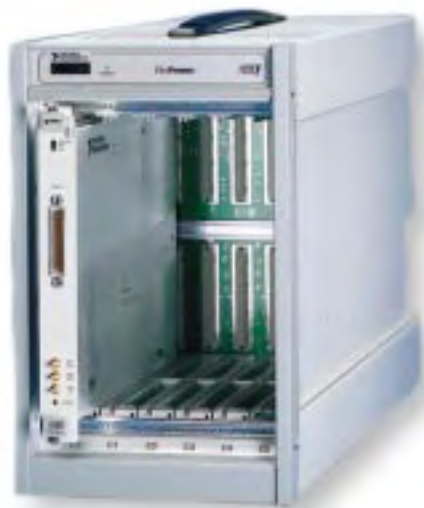
VXI-1200 FlexFrame - Front View