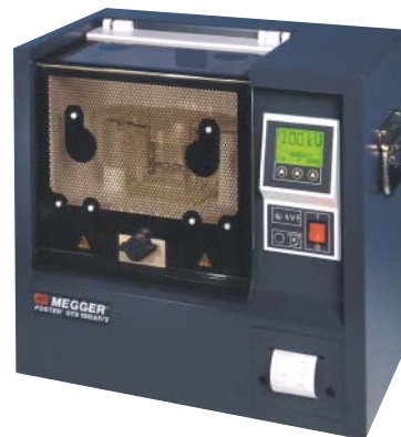
OTS60AF/2, OTS80AF/2 AND OTS100AF/2