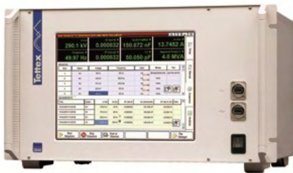
2820a & 2840 C / tanδ bridges