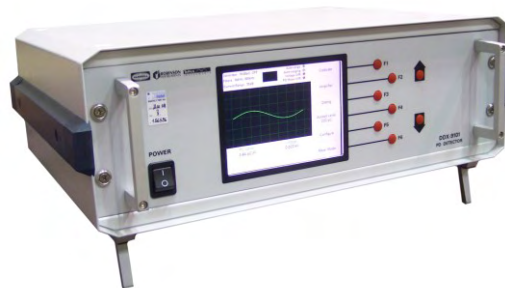
DDX Series Partial Discharge Detectors