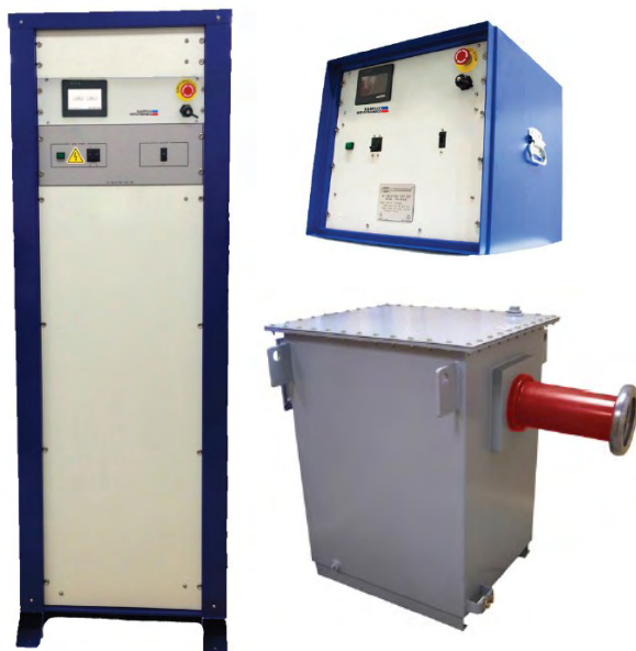
Standard System Controller: TS-PLC-AC Touch Screen Programmable Logic Controller

Hipotronics AC Dielectric Test Sets are available in a wide range of voltage and power ratings with exceptional reliability, durability and functionality. No matter what your requirement, Hipotronics has an affordably priced, highly reliable test solution to meet your needs.