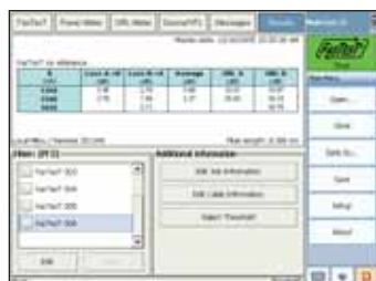
MultiTest module (OLTS) (FTB-3930 series)