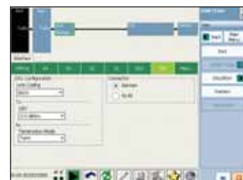
Transport Blazer (FTB-8120/8130)