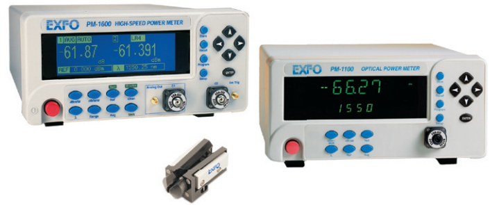
Use the BFA-3000 Universal Bare-Fiber Adapter with the PM-1600W High-Speed Power Meter, and ensure repeatable measurements when testing non-connectorized components.

When using the PM-1600 High-Speed Power Meter in automatic gain range mode, power fluctuations of up to 89 dB will stabilize in 12 ms and a continuous rate of up to 256 samples per second can be produced. You can also manually select the gain range for individual channels in burst mode. In this mode of operation, the PM-1600 stabilizes in less than 1 ms, with rates as high as 4096 samples per second.