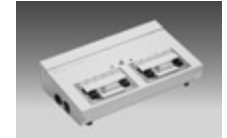
A600011 : Test Fixture (6 channels)