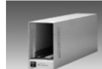
6301 : Mainframe for single Load module