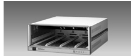
6304 : Mainframe for 4 Load modules