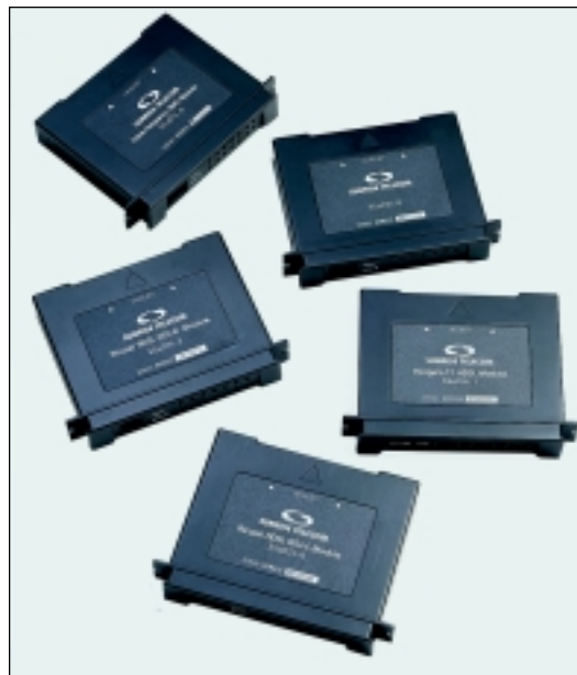
The ATU-R Module is part of a family of Plug-In Modules for the SunSet xDSL Modular test set